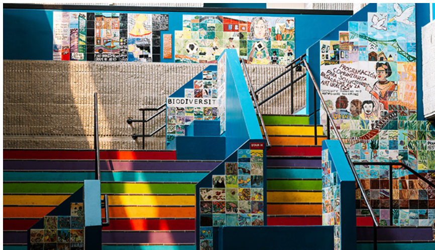
Sea Level Rise Mural, an impressive 600-plus tile bilingual mural housed in Umana Academy.