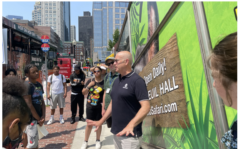
Students have toured Roxbury's historic Wakullah Dale neighborhood.