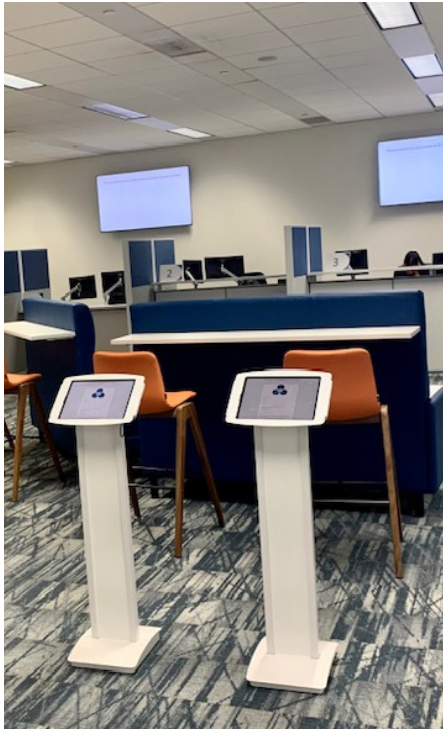
View of the newly restructured The One Stop