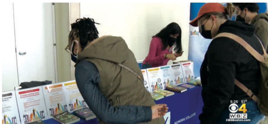
The Honors College's Banned Book Fair was featured on WBZ-TV.