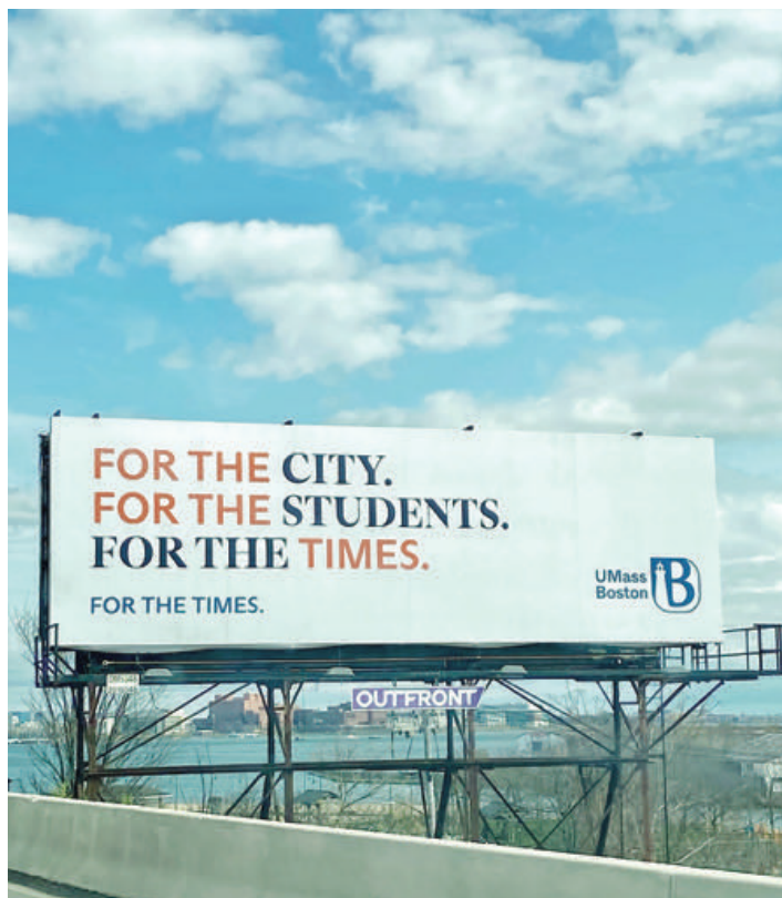
A billboard featuring the new marketing campaign.

Learn more about UMass Boston's new look and campaign.