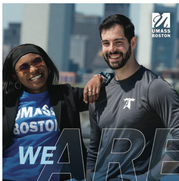
The front cover of the transfer student recruitment brochure that won gold in the Annual Educational Advertising Awards.

"When I came into college, I didn't even really know what scientific research was," she said. "I'd never seen a pipette before my first Bio 111 lab, so I had no idea how any of this works. I was always interested in science but didn't know what I could do with it. Without my professors and advisors there's no way I'd be doing what I'm doing today."