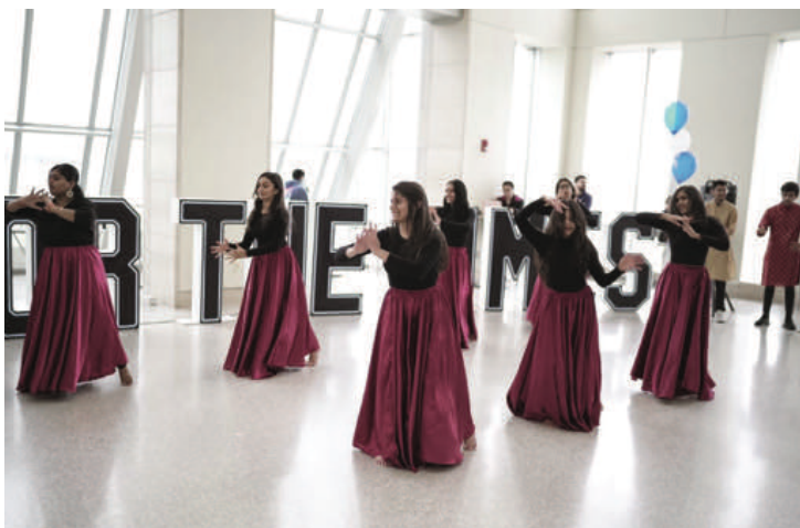
Bollywood group UMB Naach performs at the brand launch event.