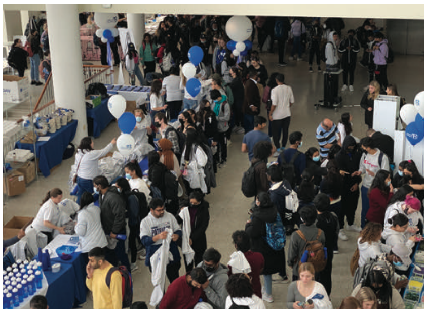
Hundreds of UMass Boston students, faculty, and staff came out for the university's brand launch event.