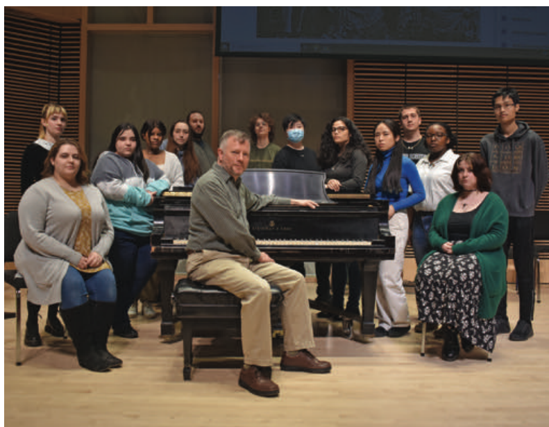
The UMass Boston Chamber Singers