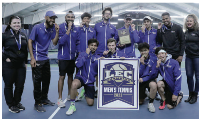
The Beacons men's tennis team won the 2022 Little East Conference Championship.