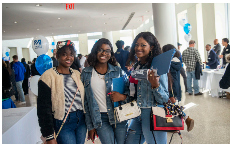
Hundreds of prospective Beacons visited UMass Boston in October for Open House.

While still enrolled at UMass Boston, the student will also receive Coast Guard active-duty benefits and pay, as well as valuable leadership, management, law enforcement, navigation, and marine science training. After graduation, they will enter officer candidate school and have a guaranteed job as a Coast Guard officer. To start, one UMass Boston student will be accepted into the program each year.