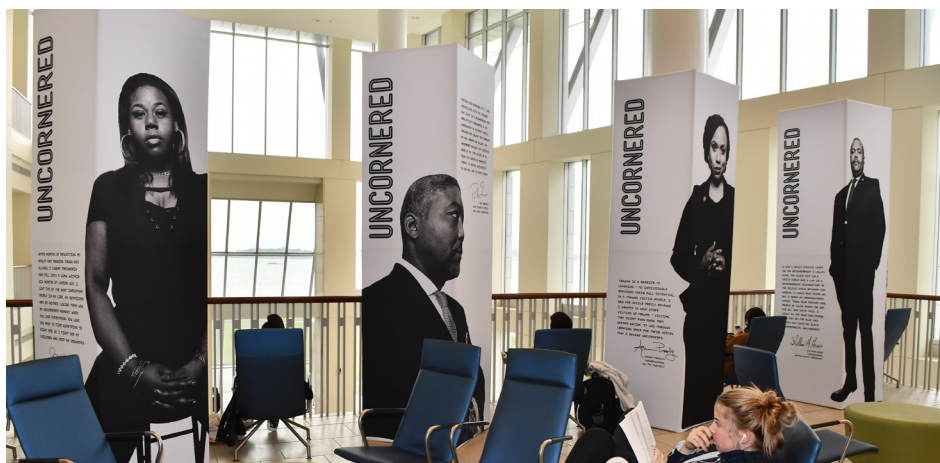
The Uncornered Photo Documentary Project was on display in the Campus Center in October as part of Diversity Month.