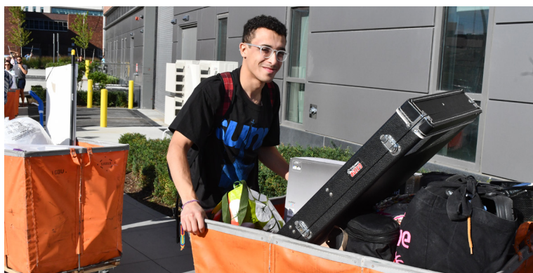
UMass Boston welcomed 1,000 students into its residence halls at the start of the semester.

Representatives from across the university shared information about UMass Boston's academics, student life, financial aid, athletics, housing opportunities, and the application process. Additionally, students and their families learned about study abroad programs, veterans' services, and other support areas of the university.