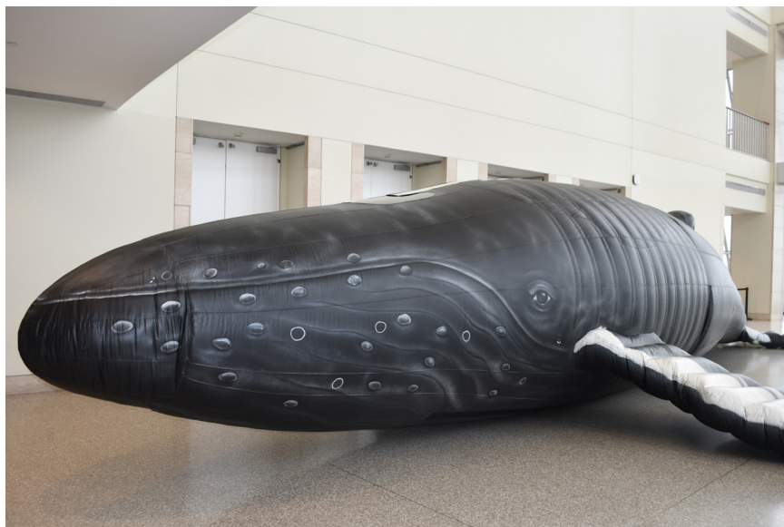
The Whalemobile is a replica of a real adult female humpback whale named Nile.