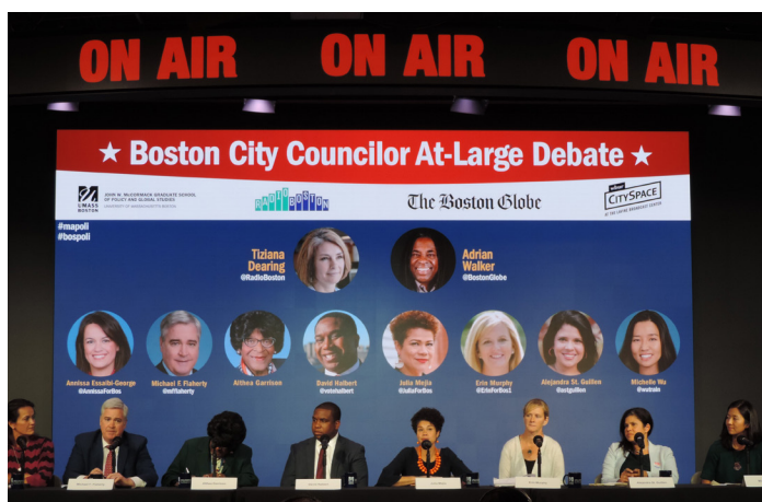
The McCormack Graduate School cosponsored a debate among candidates for Boston city councilor at-large at WBUR's CitySpace.